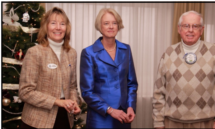
Our newest member (center) and her sponsors!