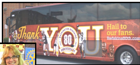
Dexter Manley & Mark Moseley were among the Redskins Alumni that visited last week.