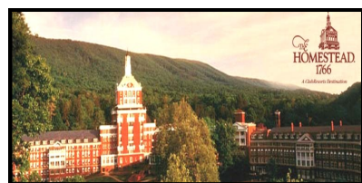
The Homestead, Hot Springs, VA