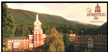
The Homestead, Hot Springs, VA