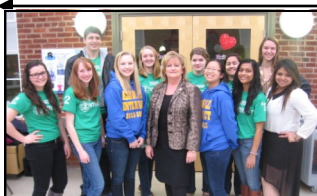
Interact Club Members