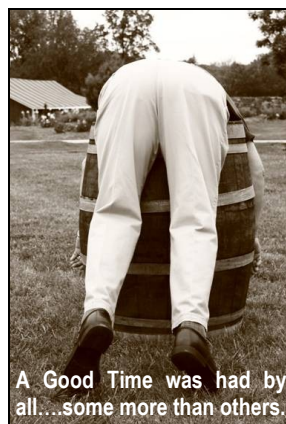
A Good Time was had by all...some more than others.