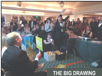
THE BIG DRAWING