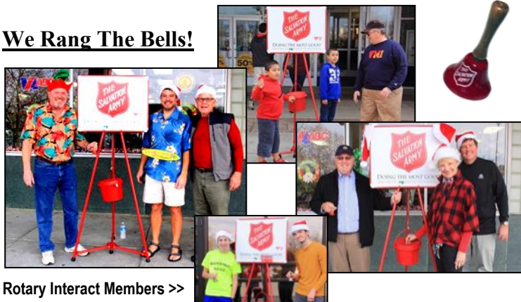
Rotary Interact Members >>